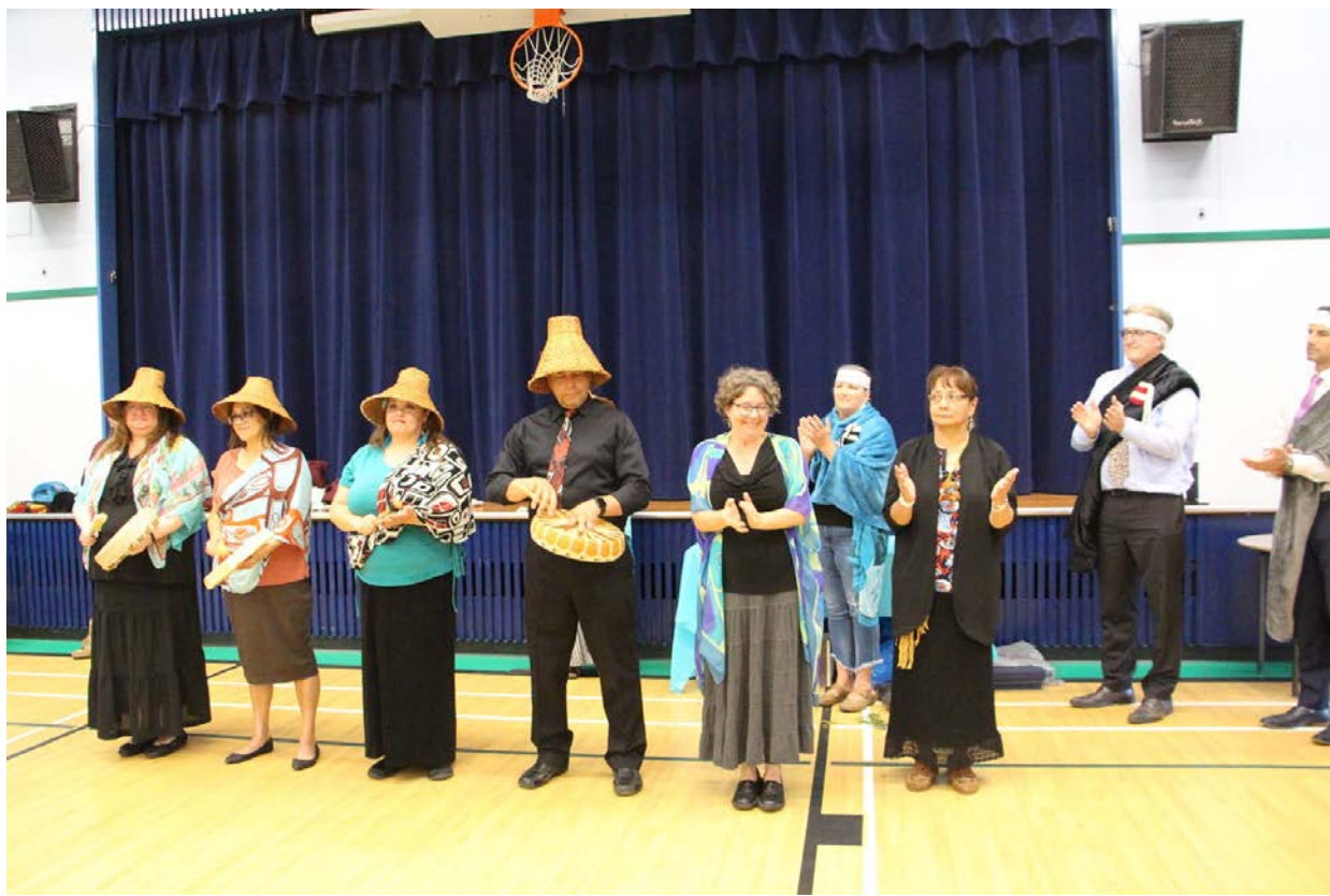
Aboriginal Team at the Qayqayt Ceremony 2018